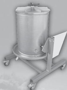
WASHING & MILLING